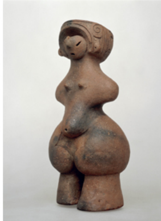
Tanabatake, 'Venus'. Tanabatake, Nagano Prefecture, Chino City Board of Education.

The Japan Foundation is supporting this exhibition which marks the first time that such a wide range of these remarkable ancient Japanese clay figures have been brought together in this country.